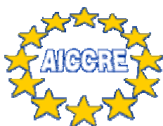
Italian Association of the Council of European Municipalities and Regions